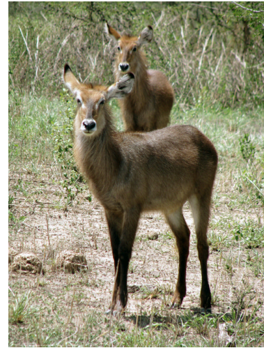
A grey striped mongoose on an abandoned termite hill at left and two female waterbucks at right.