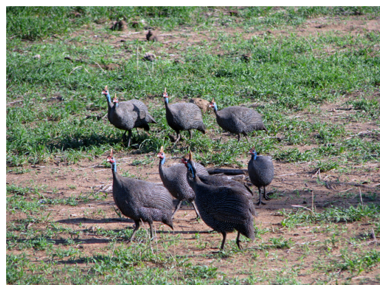
A termite hill found plentiful in dry and flat country at left. The guinea fowls were often on the menu of restaurants we visited.