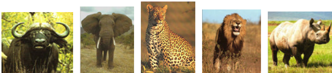
Miniatures copied from MEISTER VERLAG edition titled "Fascination Animal & Nature"

We have seen all the BIG FIVE during the safari through Kenya and Tanganyika in 1965. In Uganda it would not be possible to achieve these encounters at all.