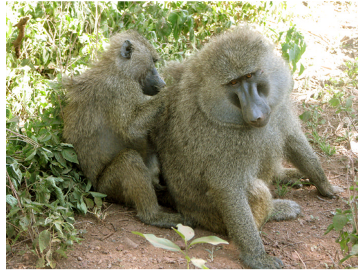
The rather shy dick-dick antelope at left and a young baboon doing the “social” duty to an elder one.

We did not have the same “luck” on the safari through Uganda in 1966 as we lost many pictures supposedly taken on two films. One complete film in my Russian made camera “Zorkii” had not been transported properly. This resulted in a “loss” of some 36 pictures at least. The second film emulsion had been spoiled by heat during the unfortunate mishap of being stuck in mud. Just bad luck!